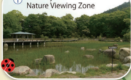
① Kabutoyama Lake and Nature Viewing Zone